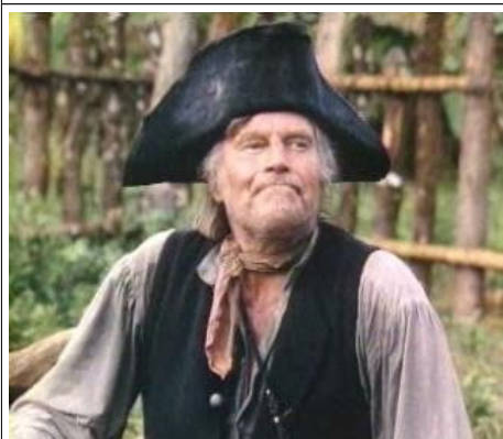
8. Charlton Heston Long John Silver Treasure Island