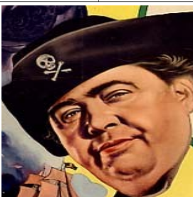
9. Charles Laughton Captain Kidd Captain Kidd