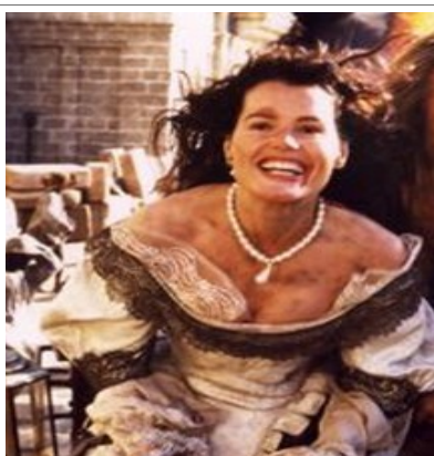
2. Geena Davis Morgan Adams Cutthroat Island