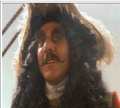
3. Dustin Hoffman Captain Hook Hook