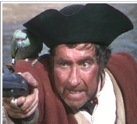
1. Robert Newton Long John Silver Treasure Island