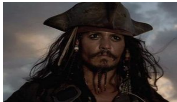
7. Johnny Depp Captain Jack Sparrow Pirates of the Caribbean