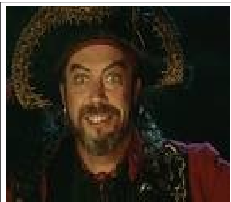
10. Tim Curry Long John Silver Muppet Treasure Island