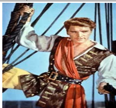
5. Burt Lancaster Captain Vallo The Crimson Pirate