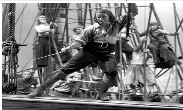
4. Errol Flynn Captain Blood Captain Blood